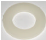
EE380212 Washer, Urethane, for ICBT Base Shell, CD-DT OEM Ref. 96906900