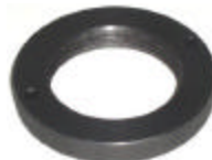
EE380211 Locking Nut for ICBT Base Shell, CD-DT OEM Ref. 96900401