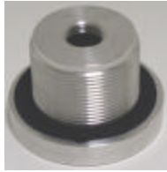
EE380209 Base Shell Assembly, ICBT, CD-DT OEM Ref. 021085094

Assembly includes: EE302060, EE303434, EE380210, EE380212