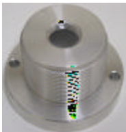
EE380210 Base Shell, Only, for ICBT, CD-DT OEM Ref. 96906800, 96906801, 96906802