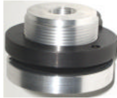
EE380213 Base Shell Assembly with Locking Nut, ICBT, CD-DT OEM Ref. 021085134, 032085097

Assembly includes: EE302060, EE303434, EE380210, EE380212