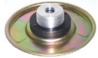
EE380214 Base Shell Assembly with Locking Nut and Magnet Plate Assembly, ICBT, CD-DT OEM Ref. 021085030

Assembly includes: EE302060, EE303434, EE380210, EE380211, EE380212